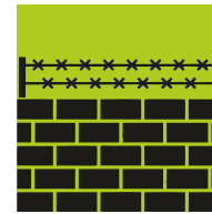
BOUNDARY WALL ACROSS 14 ACRES