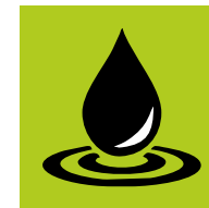
ABUNDANT GROUND WATER