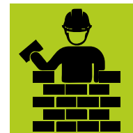
READY FOR CONSTRUCTION